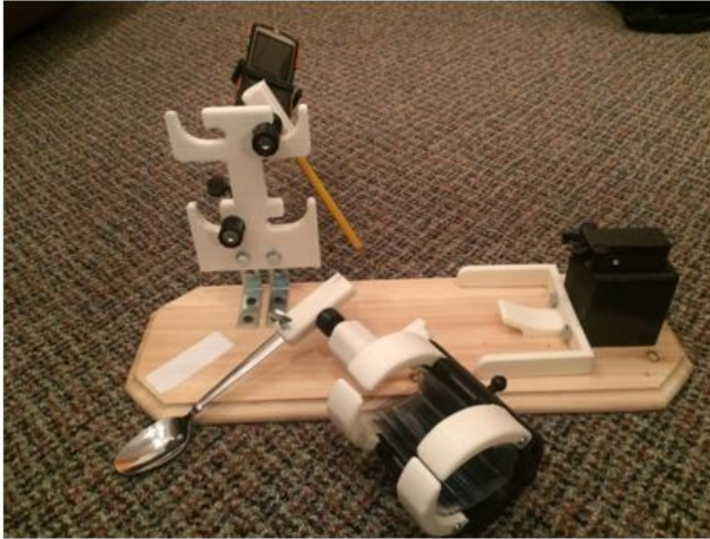
Figure 3 (Overall Assembled Unit with Attachments)

When the task is completed by the client, she would then be able to reverse the system and detach the attachment and reconnect the prosthetic interface to the docking station. In doing this she would slide the interface onto the tab and then apply a small force away from herself, locking the interface to the cabinet latch. This then gives her the ability to easily remove her arm.